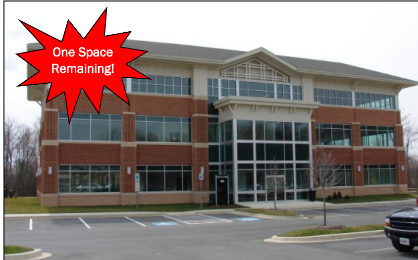
Fairview Center 4255 Altamont Place Available