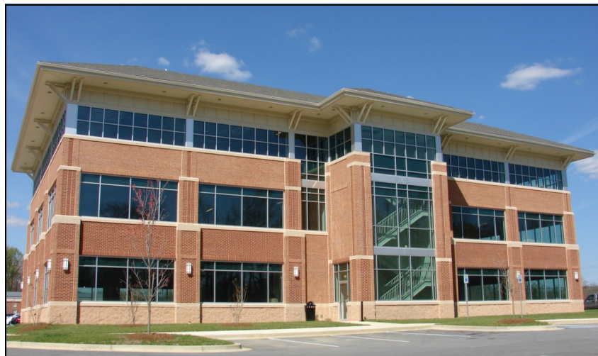
Fairview Center Building 2 Rear View